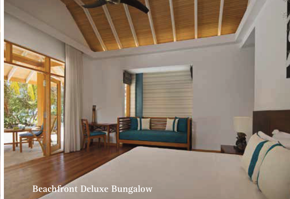
Beachfront Deluxe Bungalow