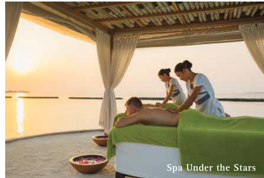
Spa Under the Stars