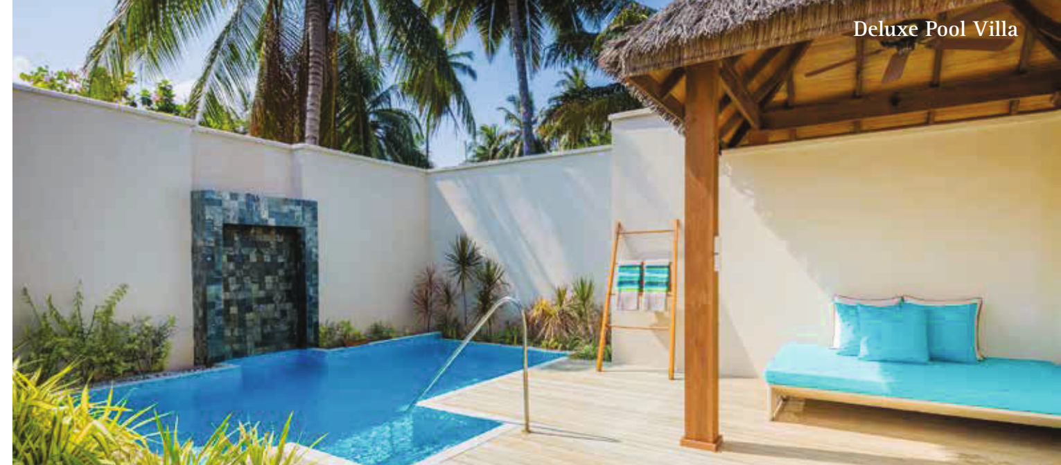
Deluxe Pool Villa

A hint of salt on the breeze. The air a perfect temperature, here on the shady side of the island. A generous space, just for the two of you. Large bedroom, adjoining sitting room. A host of extra touches that ensure you feel special. Mornings at Thila, an à la carte offering accompanied by free-flowing sparkling wine. Retreat to your spacious veranda, before prime beachfront lures you onwards. The rippling ocean, its beauty transfixes. Return from a splash in the azure waters. An invigorating rain shower in the spacious bathroom. In the evening, your private garden spa tub, perfect for soaking.