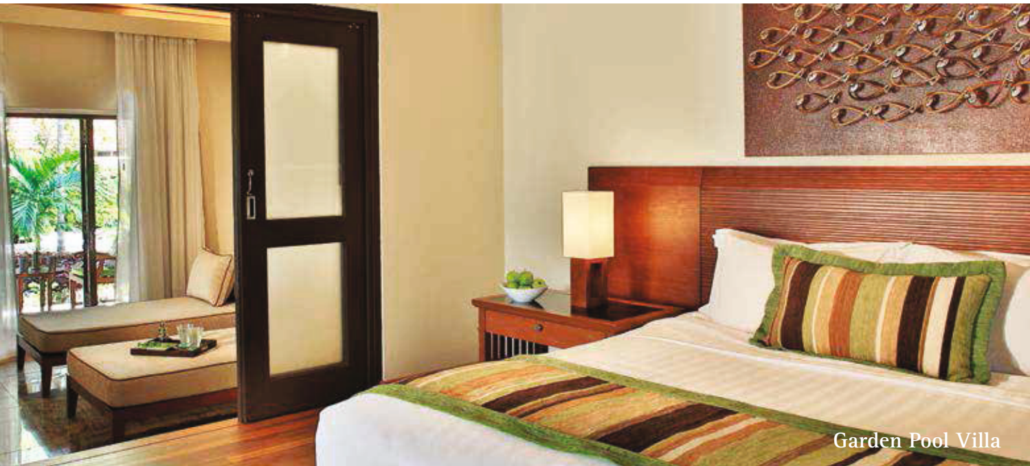
Garden Pool Villa

A dignified two-level living space; a home away from home for couples or families. Ocean views from the wide open balcony, a cup of freshly brewed Nespresso in hand. Your favourite breakfast, cooked to order at Thila. Endless days frolicking in the clear waters. Afternoons at Kandu Bar. Refreshing cocktails. In the evenings, moments of intimacy; poolside dining for two in your enclosed courtyard. Perfect privacy, the stars above. After active days, deep slumber on the master bedroom's king-sized bed.