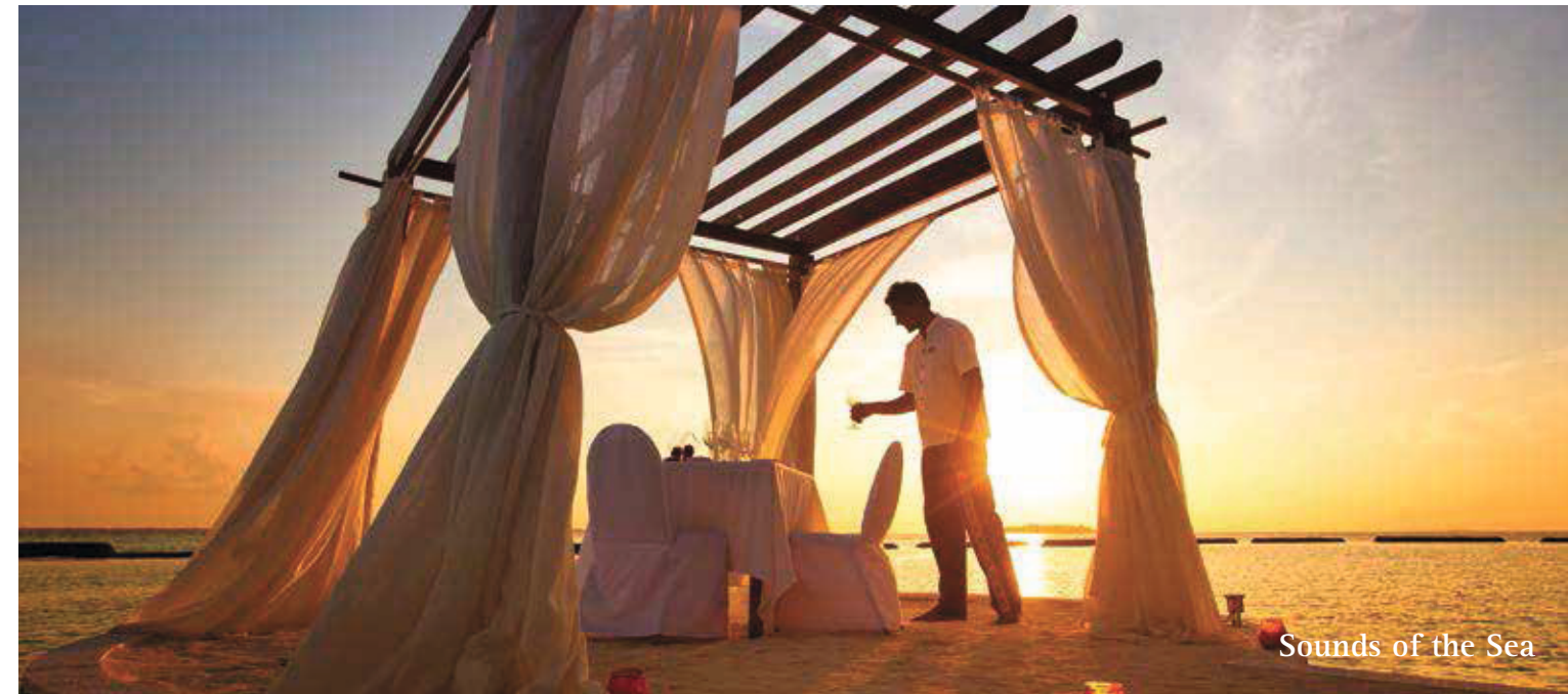
Sounds of the Sea

No interruptions. Just the two of you and the sounds of the sea. The stars above. Sumptuous courses arrive, one after the other. Perfect romantic dinner with thoughtfully matched fine wines. You toast. Eyes meet, telling stories. Everything perfect. Personal butler on hand. You will remember this night. The cool sand underfoot, the moonlit waves stretch onward.